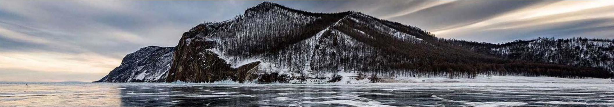
Address a Complex Problem