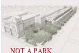
NOT A PARK